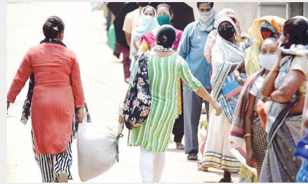
Heavy load: Two women carrying a bag of rice as others wait in queue for ration in Guwahati, Assam.